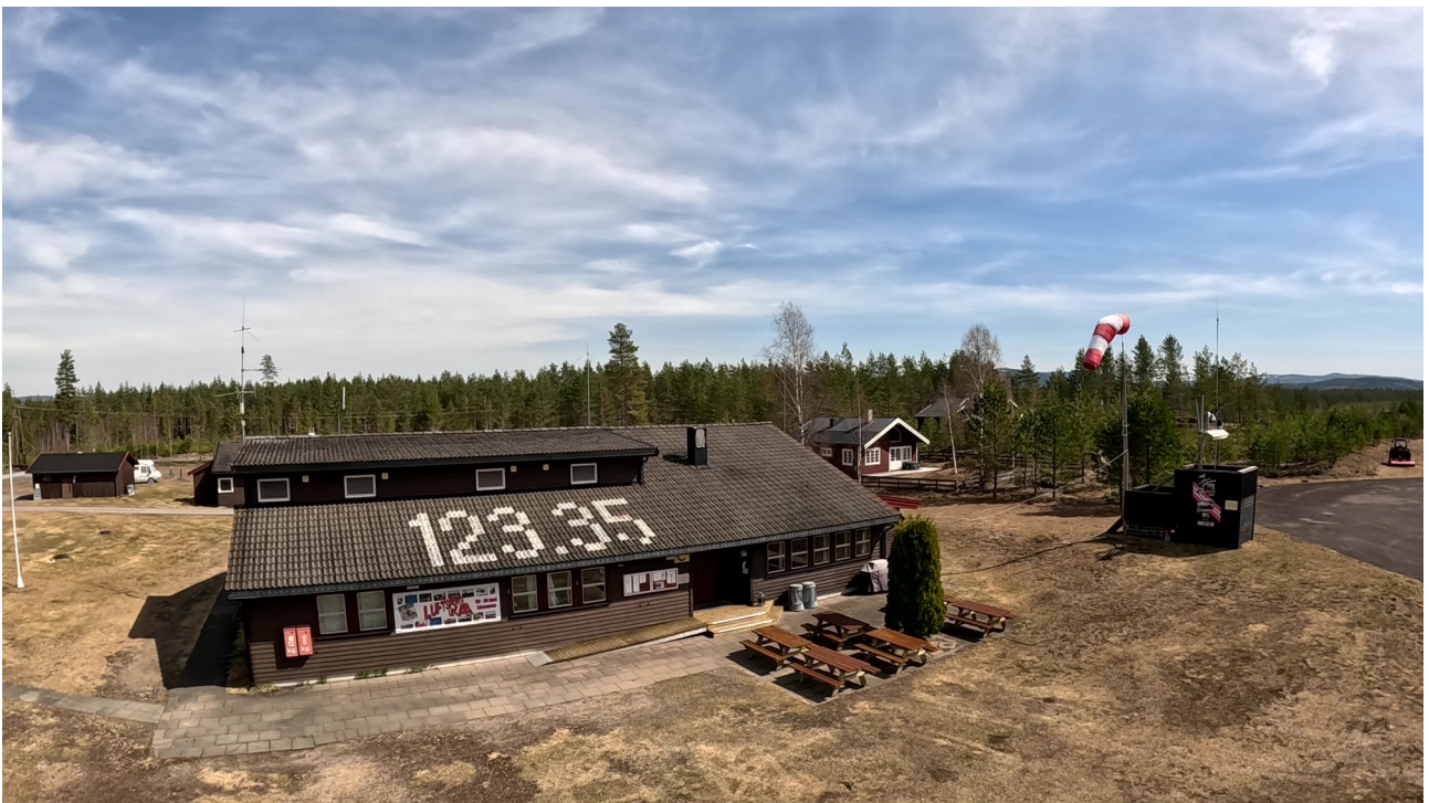
Main building with office and space for social and food