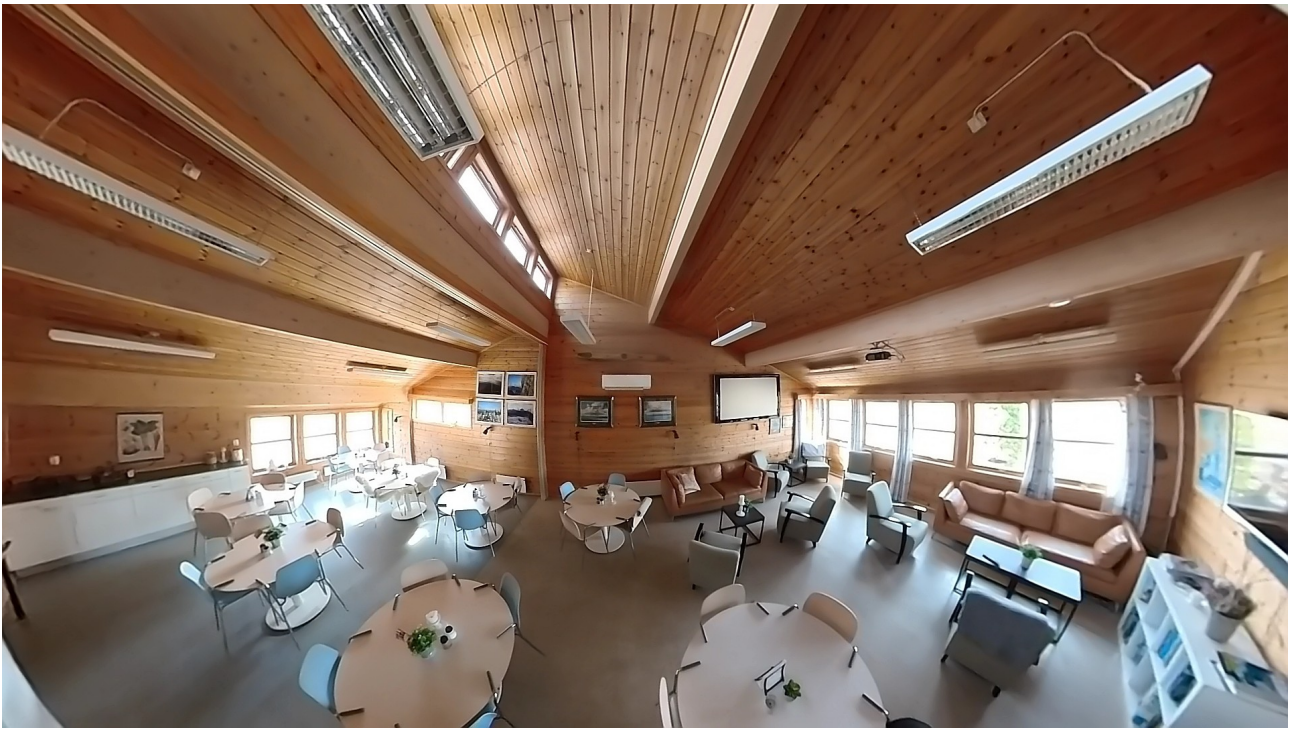
Breakfast area. With larger numbers the serving will be in tent