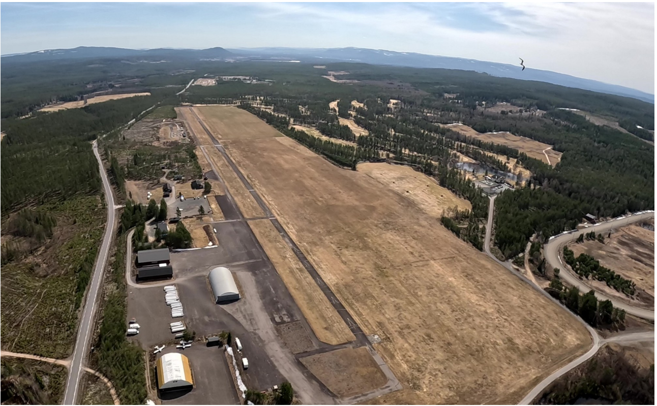
Overview looking south