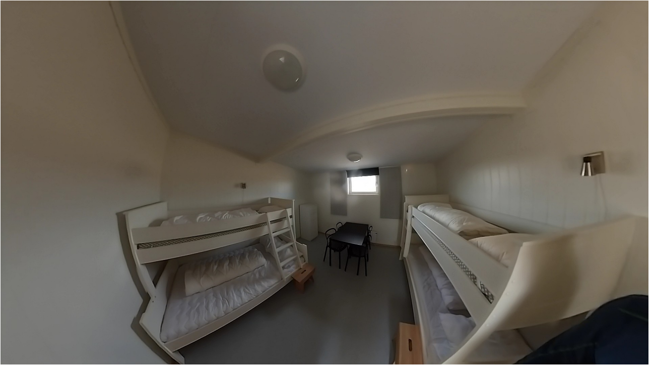
4 bed room on site