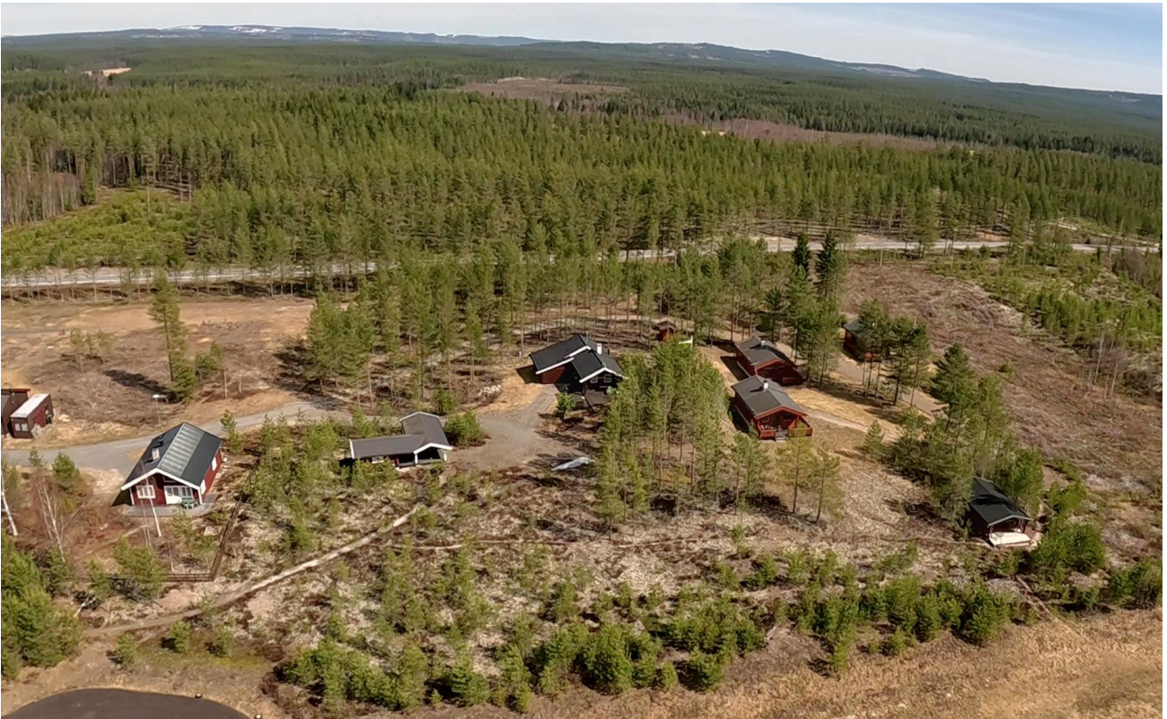
5 cabins on site available (200m from flightline)