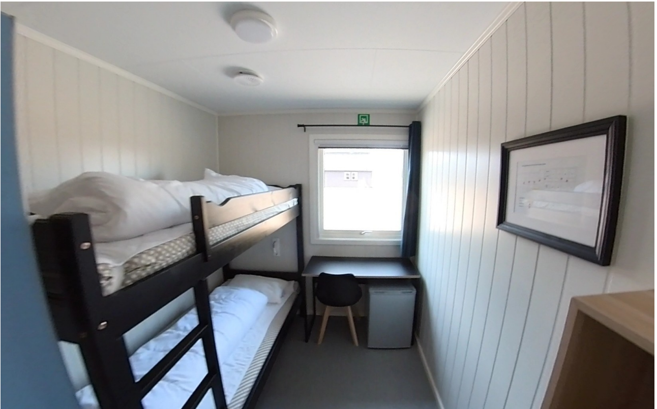
One of the 2 bed rooms available on site