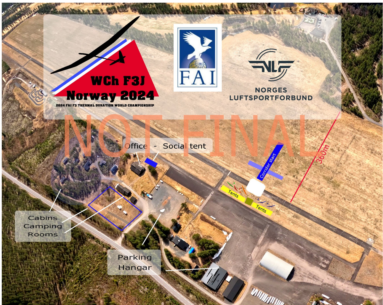
Airfield layout provisional

prices for breakfast/lunch/dinner on field will be made available