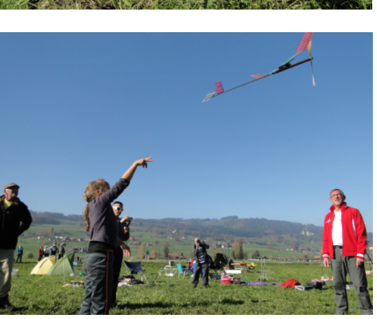
Up, up and away