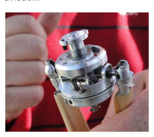
Propeller hub of rubber powered model