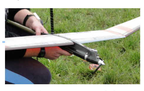
Nose of a power model (class F1C) with fully integrated motor