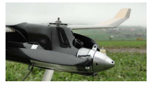
Launch of F1C model