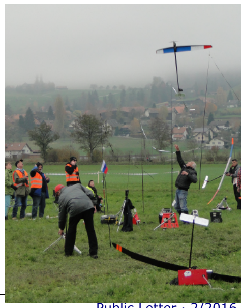
Public Letter · 2/2016