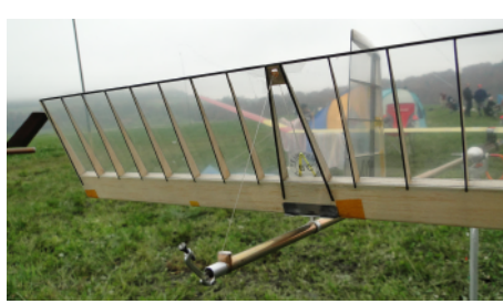
Descent position of the tailplane